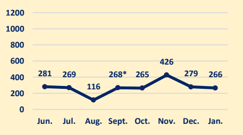
Figure 7. PPE Collected by Type – Jan 2024