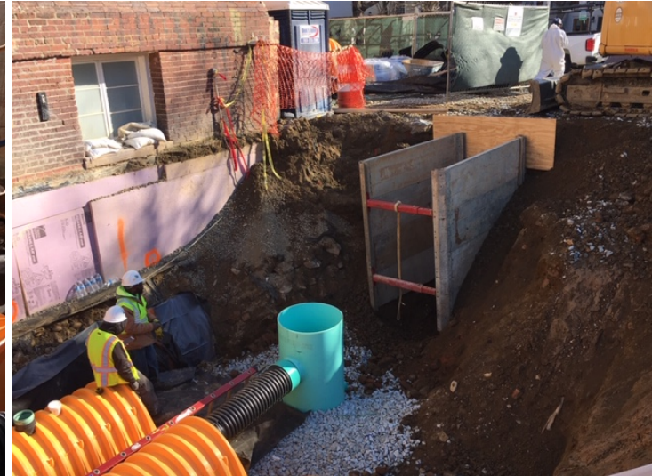
Storm Water Management System – Infiltration Trench