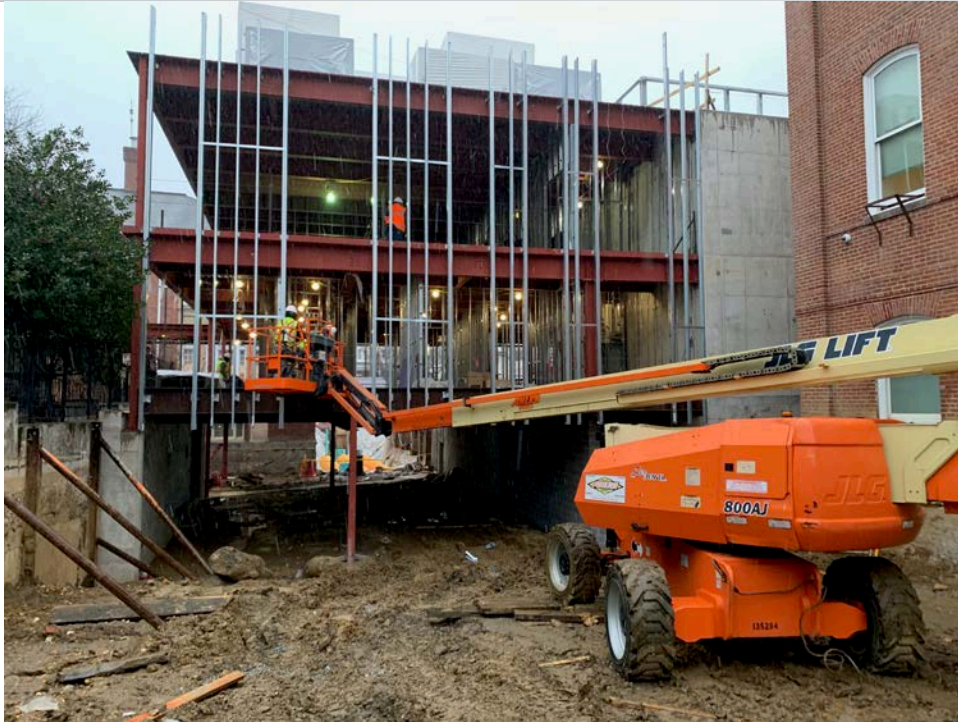
Exterior Framing/ Façade work – North Wing