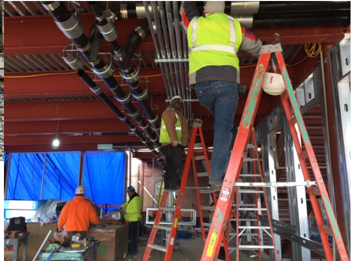
MEP Rough-in Installation—First floor of Addition