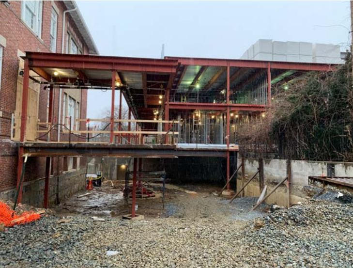
Connector/Overhang Structure and Framing—East Wing