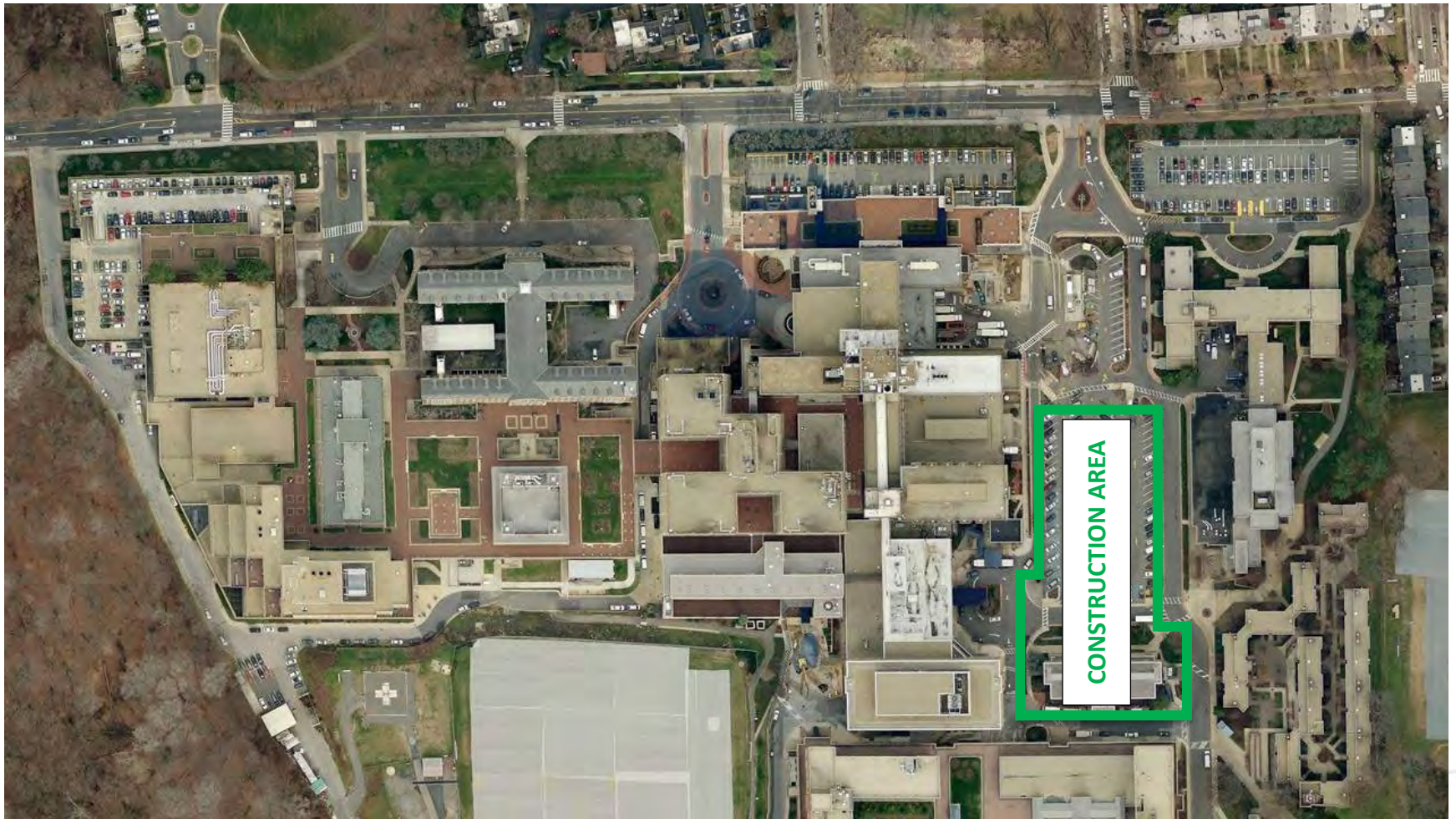
Approximate MGUH Construction Area