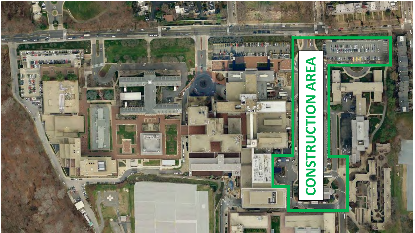
Approximate MGUH Construction Area