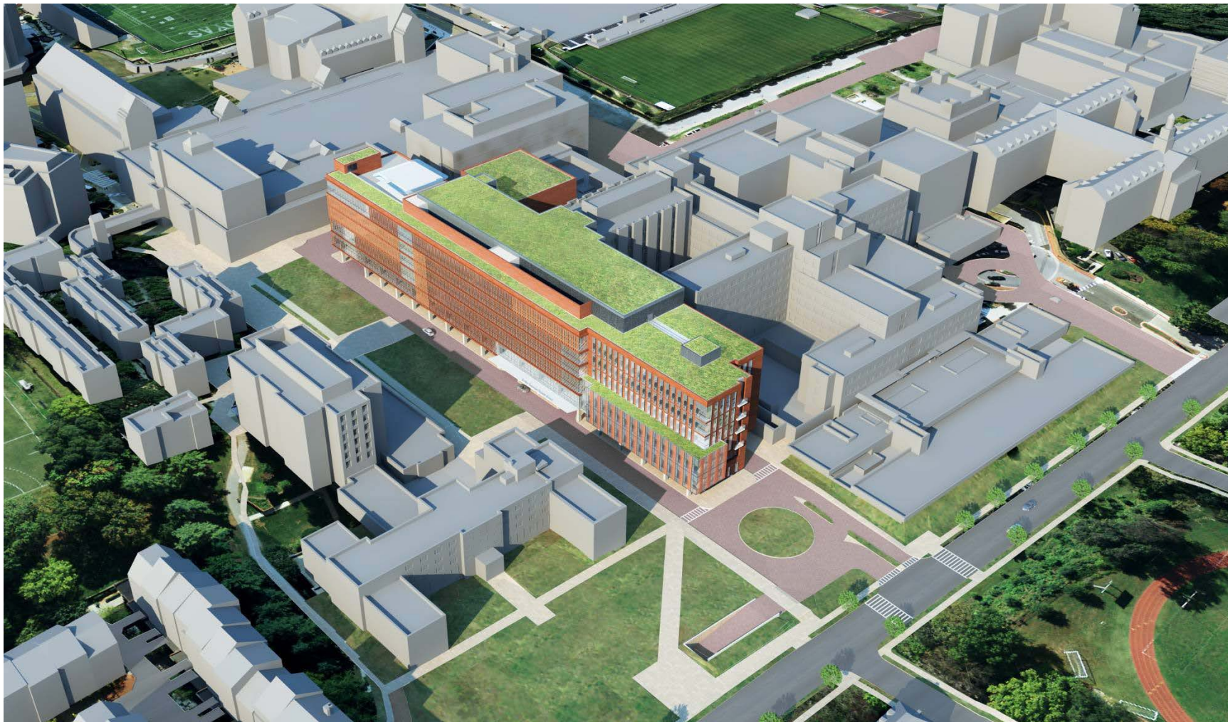
Conceptual Rendering: HKS | Shalom Baranes JV