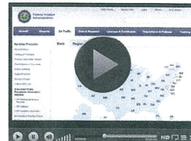
IFP Information Gateway Instructional Video ( http://www.faa.gov/tv/?mediald=892 )

www.faa.gov/air_traffic/flight_info/aeronav/event=main.signIn