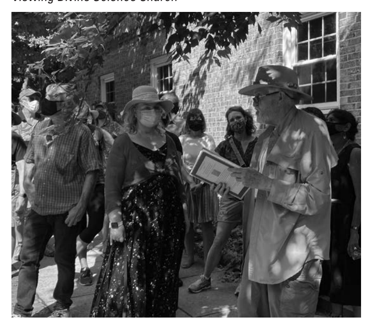
"That's a good question!"