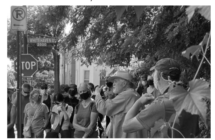
Viewing Divine Science Church