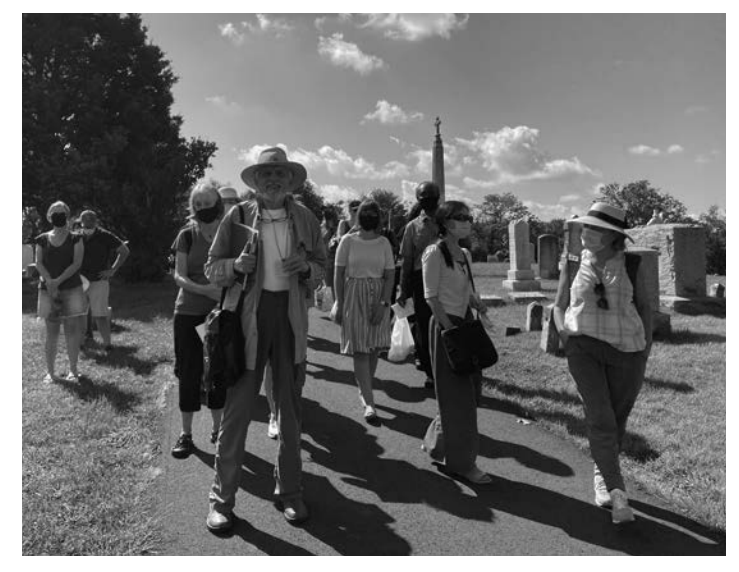
Welcome to Hood Cemetery!

Hopefully both my tour & the Burleith Annual Picnic will be back in 2022.