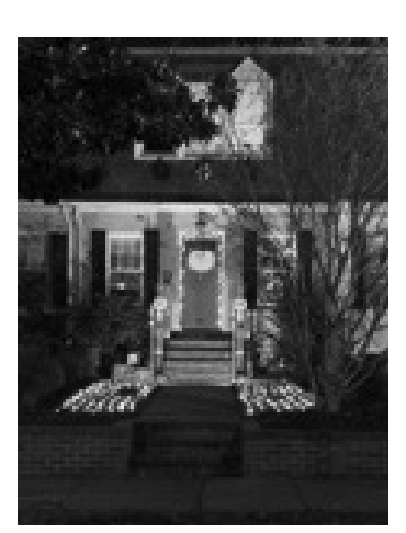
1906 37th street

Second place is 3636 S street. 3636 S street was very bright and wonderful to see from every angle at the corner of 37th and T. Lights were wrapped on trees and bushes all over the property and there were candles in every window. Garlands lined the fence and a lit Christmas tree was visible through the window. Many pedestrians and drivers were slowing to take a look at the display. They had almost every tree in their yard covered - like in National Lampoons Christmas Vacation!